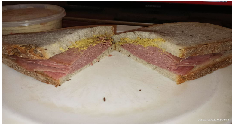
The national food of Zionism – the salami sandwich on rye bread with mustard.