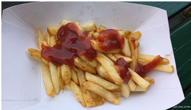
Another well-known Zionist food – French fries with ketchup.