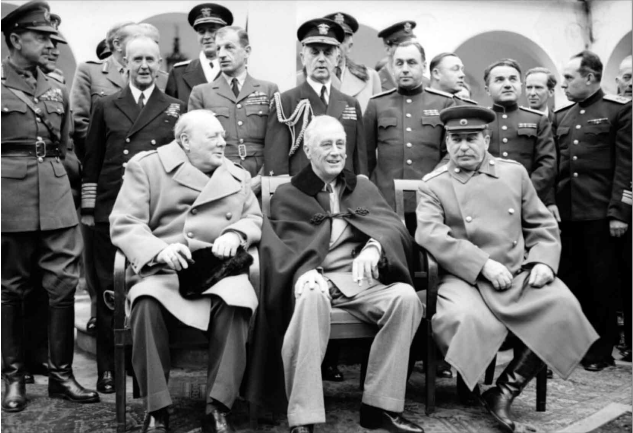
U. K. Prime Minister Winston Churchill, U. S. President Franklin D. Roosevelt, and Soviet Union Chairman Joseph Stalin in Yalta, Soviet Union, 1945