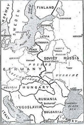
WHERE GERMAN ARMIES MARCH ON RUSSIA Shown on the map in the western frontier of the Soviet Union, a battle line of more than 2,000 miles, Berlin indicated an attack from Norway to Rumania.